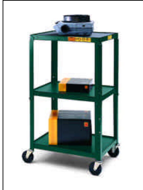
A2642 Adjustable A/V Cart (cart shown finished in Polo)

Phone: 847.678.2545 Toll-Free Phone: 800.521.9614 Fax: 847.678.0852 Toll-Free Fax: 800.343.1779 www.bretford.com